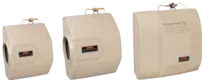
WB2-12 BYPASS HUMIDIFIER