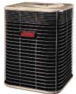
HS29 AIR CONDITIONER

Source: EPA national average energy rates.